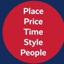
THE 5 RIGHTS