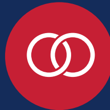
LINKING TO OTHER AGENDAS